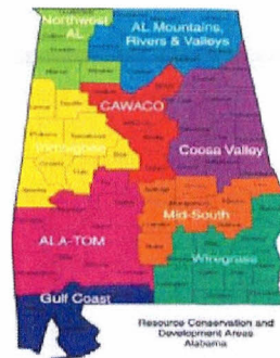
RCD Areas in Alabama

The U.S. Department of Agriculture (USDA) prohibits discrimination in all its programs and activities on the basis of race, color, national origin, age, disability, and where applicable, sex, marital status, familial status, parental status, religion, sexual orientation, genetic information, political beliefs, reprisal, or because all or a part of an individual's income is derived from any public assistance program. (Not all prohibited bases apply to all programs.)